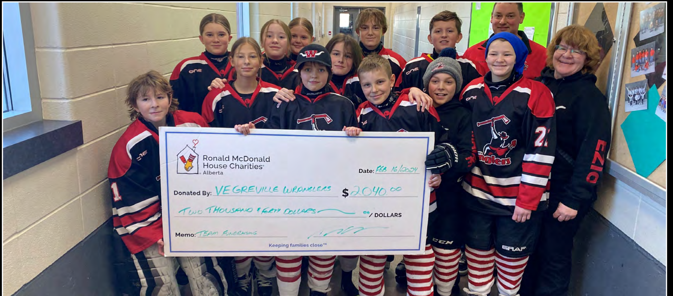
Team Challenge Winner- Vegreville Wranglers raising $2,826. All team fundraising totaled almost $11,000.