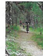
Biking and Quad Trails