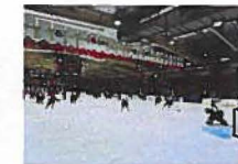
Bonnyville and District Centennial Centre