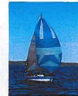
Sailing on Cold Lake